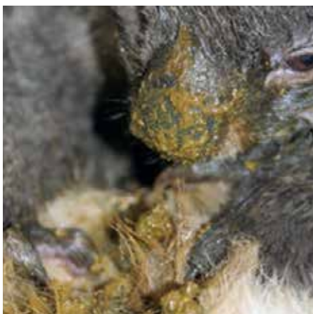
Pixie eating pap.