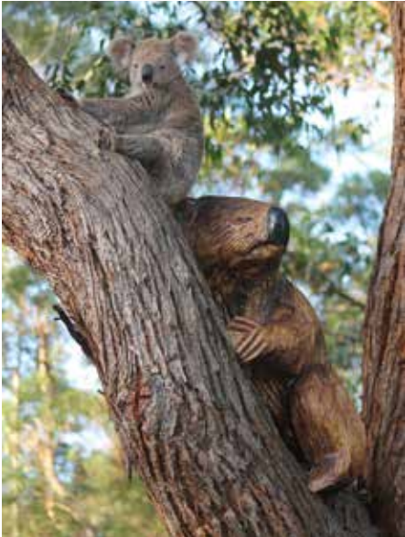
Are you my mother?