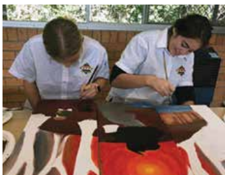
Hastings Secondary College students.