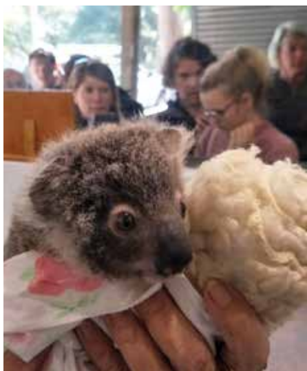
Always a draw card.

In May 2019 a female koala called Ocean Drive Thomasina was hit by a car just south of Port Macquarie in what is considered a major “hot spot” for vehicle strikes. This notorious stretch of road has claimed the lives of many koalas and is still, to this day, an area we are struggling to control.