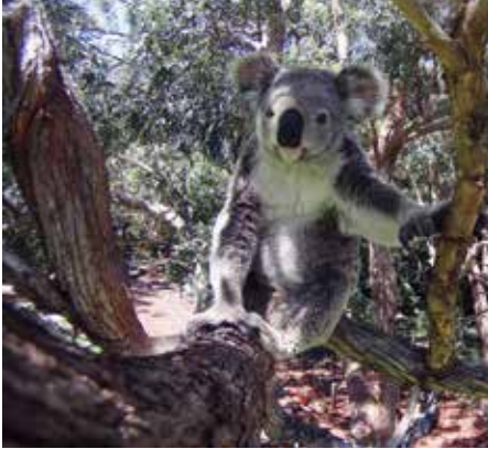
Koala saying g'day to the koala cam