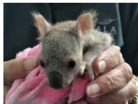
Pixie, May 2019, 195 grams.