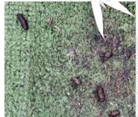
Koala scat vs kangaroo poo - koala poo.

Note: If you are visiting or local to Port Macquarie and happen to see a koala, please inform the Koala Hospital by calling our 24 hour hotline 6584 1522 or email sightings@koalahospital.org.au . We love getting photos too, so feel free to email your snaps!