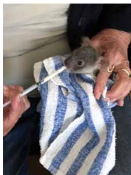
Feeding Pixie 2019.