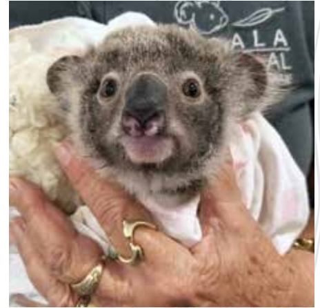
Pixie today, August 2019.

Her progress will be reported in the next issue of Gum Tips or you can find updates on the hospital’s Facebook and Instagram posts. Fingers crossed everyone!