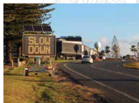
Temporary signs installed on Ocean Drive.