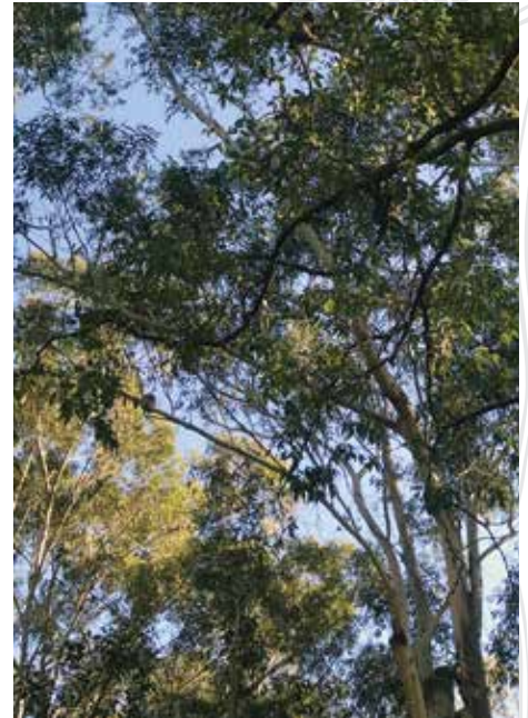
Spot the joey - the 'bump' (bottom branch LHS)

The Koala Recovery Partnership is also interested in working with corporate stakeholders who may be interested in purchasing high-quality habitat for philanthropic reasons, carbon credits or biodiversity credit rewards.