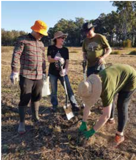
Tree planting Maria River Road 2019.

On a warm, sunny Sunday at the end of July, 35 volunteers from the Koala Hospital and Charles Sturt University gathered at the Koala Hospital's Maria River Road plantation to plant koala food trees.