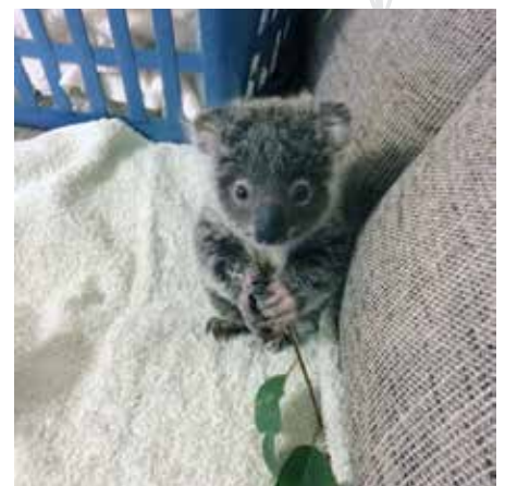
Getting bigger, August 2019.