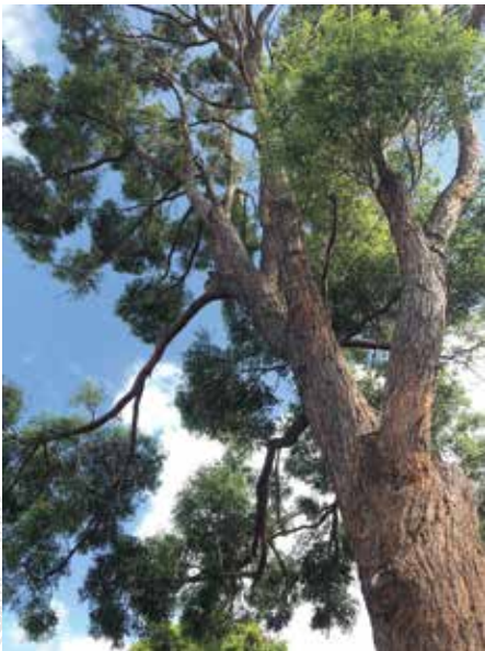
Spot the koala high in the tree.

Who doesn't get excited when they hear the words "Look, there's a koala!" We rush to look up and start scanning the tree tops. "Yep, there he is...on that branch. Awww, so cute, he's fast asleep."