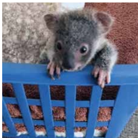
Pixie August 2019.